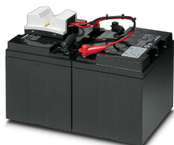
Energy storage device, lead AGM, VRLA technology, 24 V DC, 38 Ah, automatic detection, and communication with QUINT UPS-IQ

Please be informed that the data shown in this PDF Document is generated from our Online Catalog. Please find the complete data in the user's documentation. Our General Terms of Use for Downloads are valid ( http://phoenixcontact.com/download )