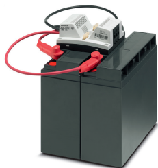
Energy storage, lead AGM, VRLA technology, 24 V DC, 20 Ah, automatic detection and communication with QUINT UPS-IQ

Please be informed that the data shown in this PDF Document is generated from our Online Catalog. Please find the complete data in the user's documentation. Our General Terms of Use for Downloads are valid ( http://phoenixcontact.com/download )