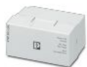
Replacement battery module, lithium-ion, 18.5 V DC, 46 Wh

Battery - STEP-BAT/LI-ION/18.5DC/46WH - 1081355