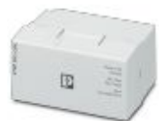
Replacement battery module, lithium-ion, 18.5 V DC, 46 Wh

Battery - STEP-BAT/LI-ION/18.5DC/46WH - 1081355